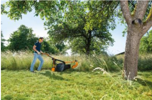
Photo 1: Rethinking mowing procedures in peripheral areas means reducing the number of mowings per year, and delaying the first mowing.